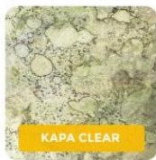
UG KAPA CLEAR 4mm