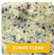
UG ZUMRE CLEAR 4mm