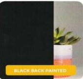
UG BP004BLK-T 4mm