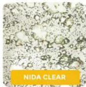
UG ZUMRE CLEAR 4mm