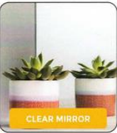
UC 002/3/4/6-T 2mm, 3mm, 4mm, 6mm