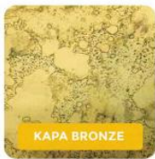
UG KAPA BRONZE 4mm