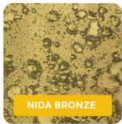
UG NIDA BRONZE 4mm