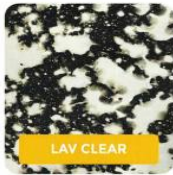
UG LAVA CLEAR 4mm