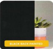
UG BP004BLK-T 4mm