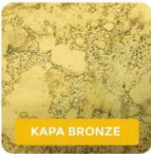
UG KAPA BRONZE 4mm