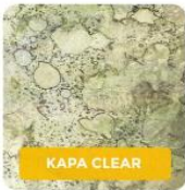
UG KAPA CLEAR 4mm