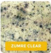
UG ZUMRE CLEAR 4mm