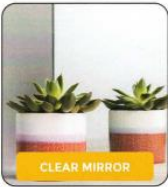
UC 002/3/4/6-T 2mm, 3mm, 4mm, 6mm