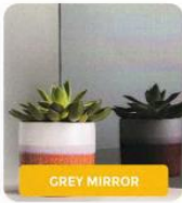
UC 600GRY-T 6mm