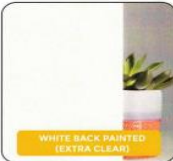
UG BP004EXW 4mm