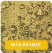
UG NIDA BRONZE 4mm