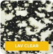
UG LAVA CLEAR 4mm