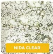
UG ZUMRE CLEAR 4mm