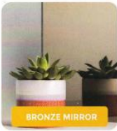
UC 300/600B-T 3mm, 6mm