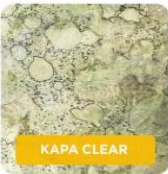
UG KAPA CLEAR 4mm