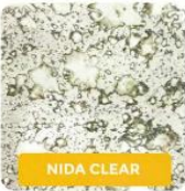
UG ZUMRE CLEAR 4mm